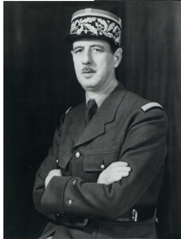
Charles de Gaulle France