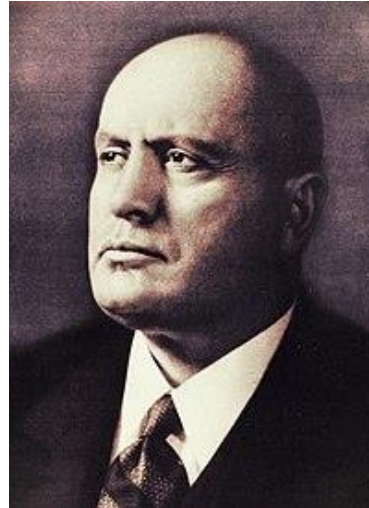
Benito Mussolini Italy