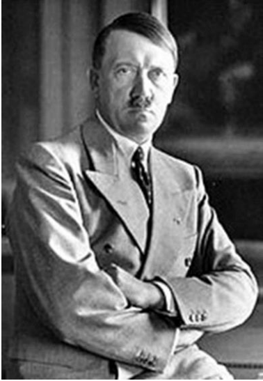
Adolf Hitler Germany