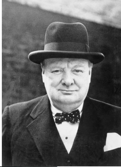
Winston Churchill Great Britain