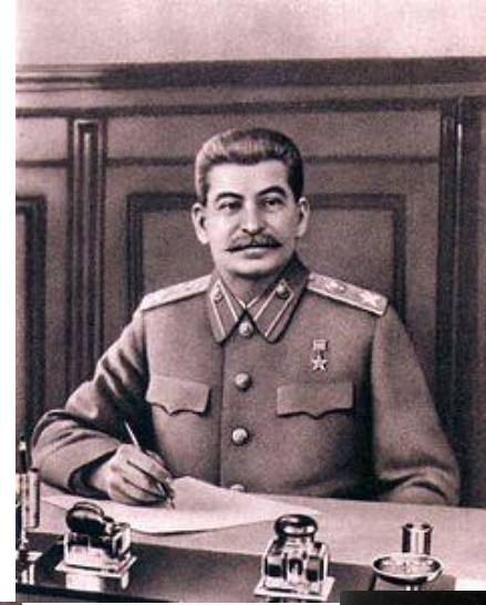
Joseph Stalin Russia (USSR)