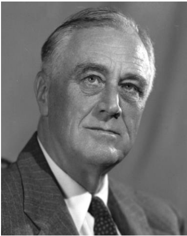
F D Roosevelt USA