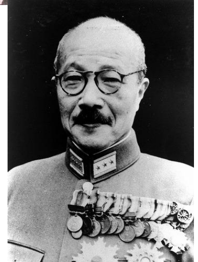
Hideki Tojo Japan